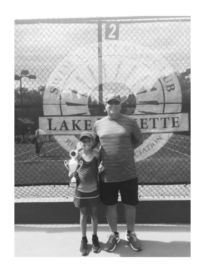
Summer Tennis and Pool Fun