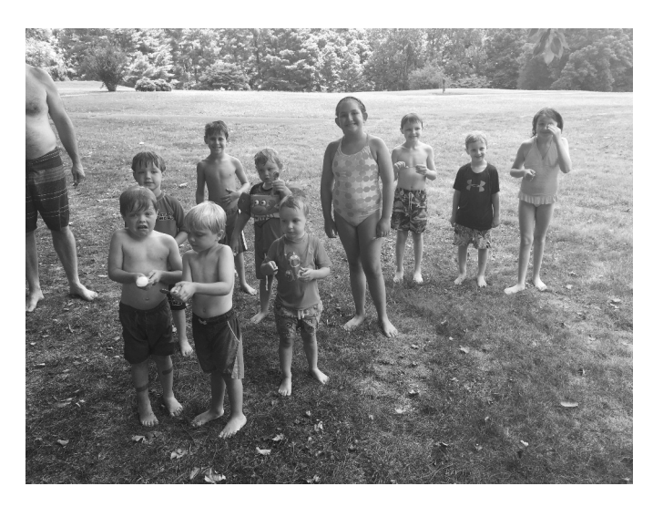
Fun at the Pool