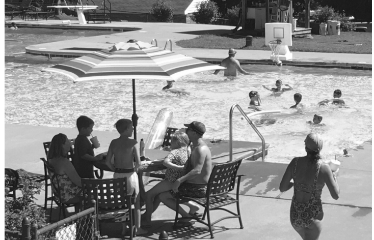
Fun at the Pool