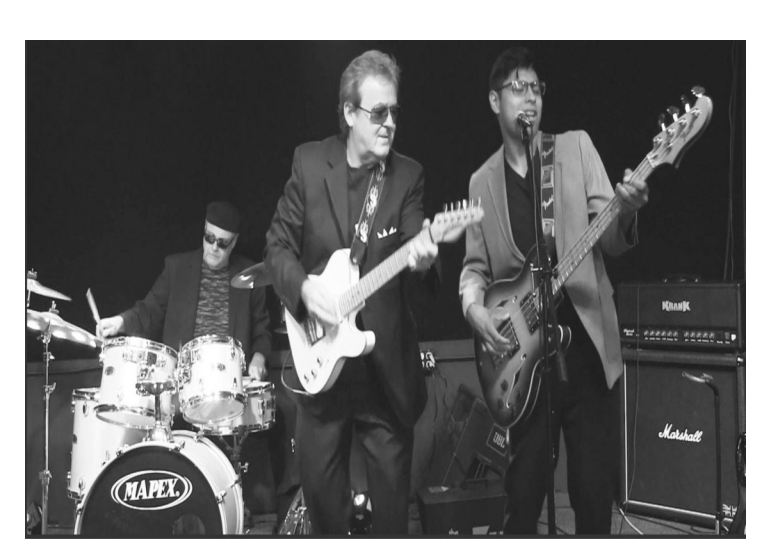
Heart Beat of Soul at Member Guest